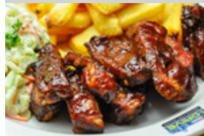
ST. LOUIS STYLE RACK OF RIBS

House made breaded chicken breast pan fried to perfection. Topped with marinara sauce, mozzarella cheese and herbs. Served with spaghetti and your choice of tomato sauce or alfredo sauce. - 15.29