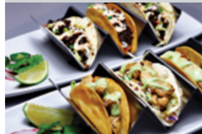
KOREAN BBQ & MOJO CHICKEN TACOS